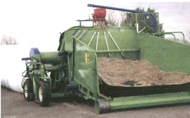
Fig. 2. Silage bagger with an applicator

Equally good results are obtained in case of application of the technology of ensilage fodders in foil sleeves. Almost all the farm fodders (grass, papilionaceous plants, corn, wet corn grain, cereals, pressed beet pulp, brewer's spent grain and other ones) are suitable for being preserved in a foil sleeve. An appropriate pressing machine (drawing 2) is necessary for silaging in foil sleeves. Different types of machines are available on the market, started from simple pressing machines powered from a trailer up to self-propelled machines. Depending on the needs, there are also available different types of foil sleeves. The diameters of bags amount from 2,4 up to 3,5 m, and from 45 up to 150 m long. Silage balers are produced by many European and American companies (Kuhn, Marangon, Ag Bag International LTD, Murska). These machines consist of a power unit, collecting basket, piston and a pressing chamber and also a guide on which foil bags are located. In this technology, shredding of material into short chaff (20-40 mm) and the level of dry matter of silaged raw material within the scope of 28-35%, guarantee obtaining of good quality of silage [1, 8, 9].