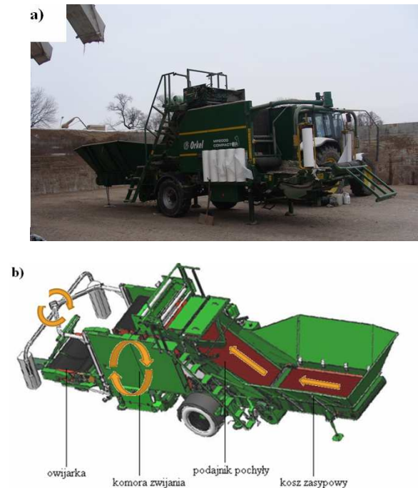
Fig. 3. Press Orkel MP 2000 Compactor: a) general view, b) construction scheme

Power demand amounts to approx. 90 kW, and efficiency is within the range of 40-60 bales per hour (up to 60 t h -1 at the dimensions of the bale 1,2 m x 1,2 m) depending on the pressed material. The source of power there may be both the farm tractor as well as the electric motor.