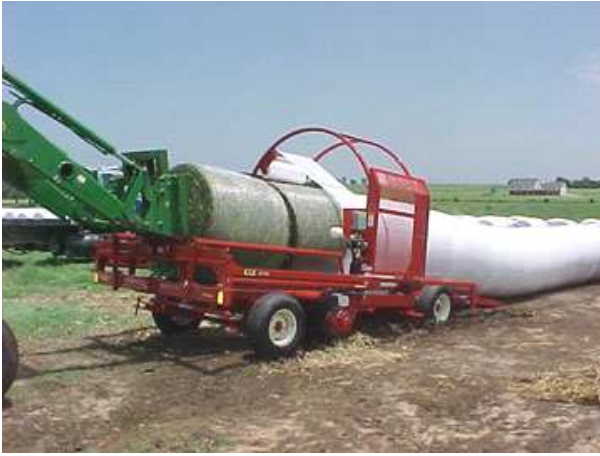
Fig. 1. Tube-Line round bale silage wrapping

Equally good results are obtained in case of application of the technology of ensilage fodders in foil sleeves. Almost all the farm fodders (grass, papilionaceous plants, corn, wet corn grain, cereals, pressed beet pulp, brewer's spent grain and other ones) are suitable for being preserved in a foil sleeve. An appropriate pressing machine (drawing 2) is necessary for silaging in foil sleeves. Different types of machines are available on the market, started from simple pressing machines powered from a trailer up to self-propelled machines. Depending on the needs, there are also available different types of foil sleeves. The diameters of bags amount from 2,4 up to 3,5 m, and from 45 up to 150 m long. Silage balers are produced by many European and American companies (Kuhn, Marangon, Ag Bag International LTD, Murska). These machines consist of a power unit, collecting basket, piston and a pressing chamber and also a guide on which foil bags are located. In this technology, shredding of material into short chaff (20-40 mm) and the level of dry matter of silaged raw material within the scope of 28-35%, guarantee obtaining of good quality of silage [1, 8, 9].