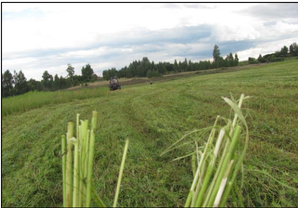
Fig. 3. A comparative view of the hemp stalks cut by a fingerbar mower (left) and a rotary mower (right)