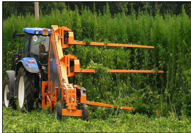
Fig. 4. A three-level hemp mower TEBECO Beagle 3.3 in operation