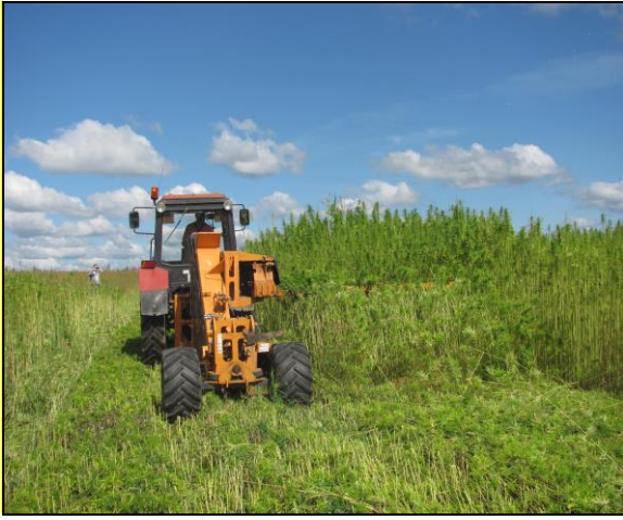
Fig. 1. A two-level hemp mower TEBECO Beagle 3.2 in operation