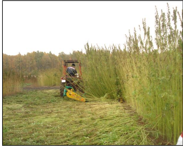
Fig. 2. A duplex mower KD – 210 in operation